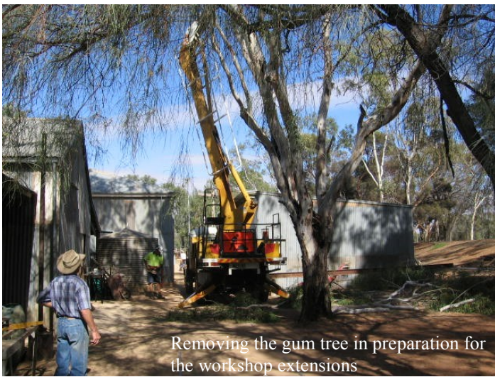
Removing the gum tree in preparation for the workshop extensions