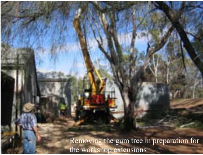
Removing the gum tree in preparation for the workshop extensions